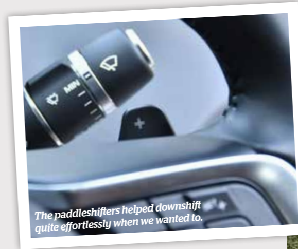
The paddleshifters helped downshift quite effortlessly when we wanted to.

unleashed torque took the entire experience to the next level.