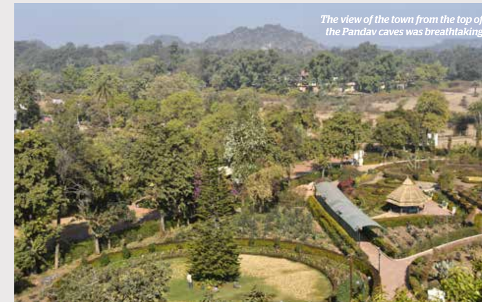
The view of the town from the top of the Pandav caves was breathtaking.

The weather was great as we got closer to Pachmarhi and away from the regular highway truck traffic I switched off the AC, opened the sunroof and enjoyed the cruise, just soaking in the beautiful countryside. Here, the petrol engine shone again. A gentle dab on the throttle was enough to overtake easily. Every time I put my foot down, the wave of