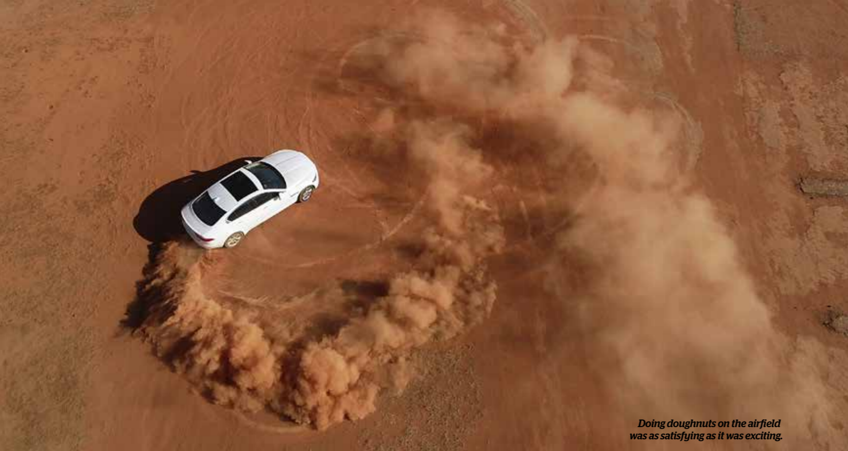
Doing doughnuts on the airfield was as satisfying as it was exciting.