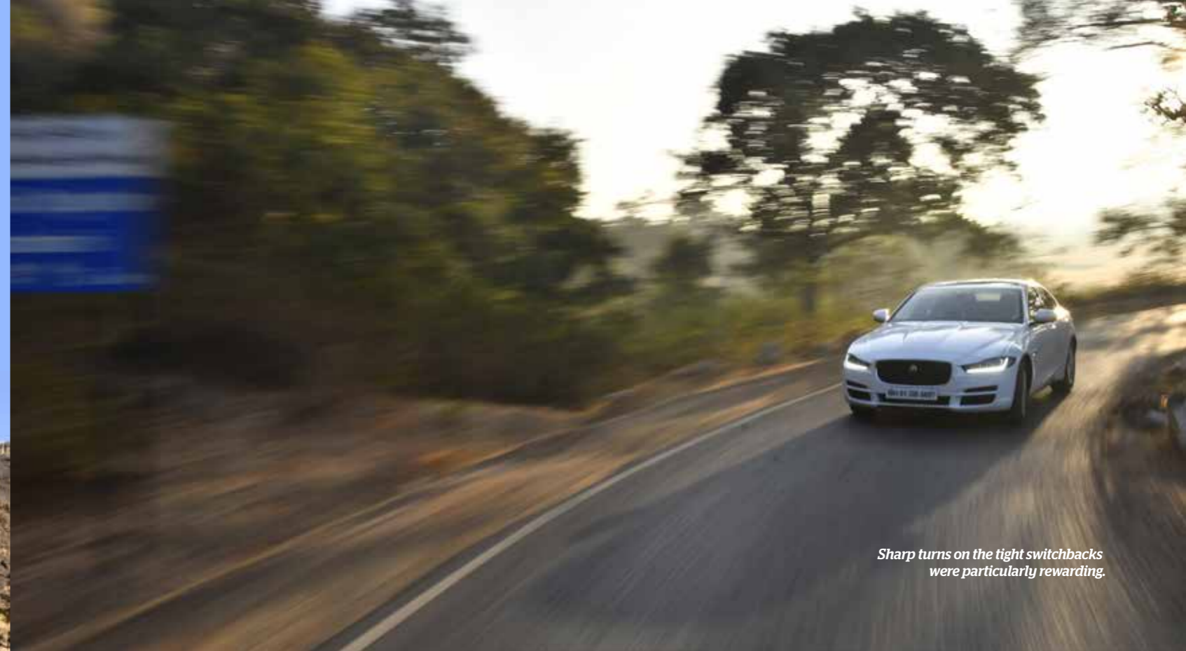
Sharp turns on the tight switchbacks were particularly rewarding.

Pachmarhi. A name on every road-tripper's bucket list. It's a hill station that remains an offbeat haven to travellers in search of a soul-satisfying experience. For me though, it wasn't just Satpura's highest peak or the Pandav caves that drew me to this hill station, it was the roads - long and winding, surrounded by forests bursting with wildlife. The fast switchbacks and tight corners entice anyone behind the wheel to really cut loose and merge with the forces of nature.